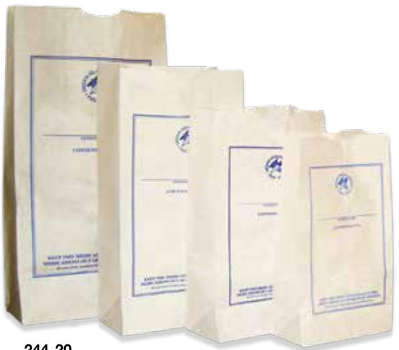
244-20 20# Stock IHS Bag 244-10 10# Stock IHS Bag 244-6 6# Stock IHS Bag 244-4 4# Stock IHS Bag