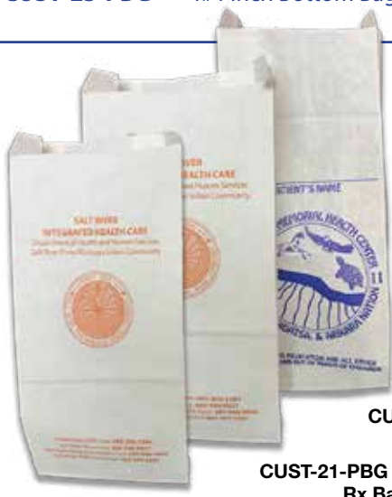
CUST-23-PBG 4# Custom Rx Bag CUST-22 -PBG 4# Custom Rx Bag CUST-21-PBG 4# Custom Rx Bag