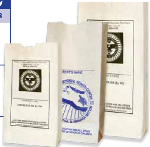
CUST-25-PBG 6# Custom Rx Bag CUST-26-PBG 10# Custom Rx Bag CUST-28-PBG 20# Custom Rx Bag