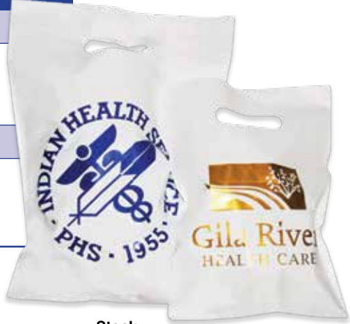
Stock IHS Bag