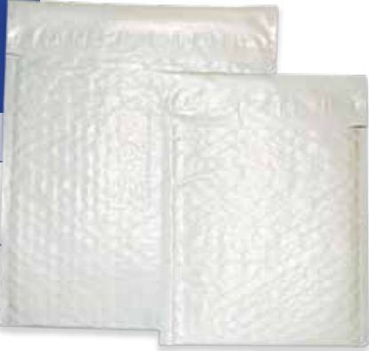
White Poly/Bubble Padded Mailer